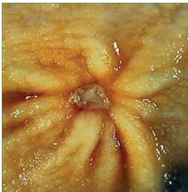
Figure 1: Gastric ulcer